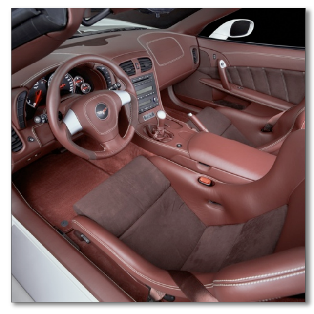
Deutschleder handmade interiors, standard on all C16s Shown with optional Sport Seats.